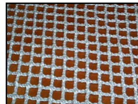
Webbings made with Dyneema® fiber

For more information: info@africancats.com www.africancats.com